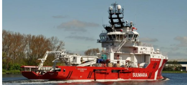
Figure 2: Image of the Ocean Marlin.

The works will be carried out both within and around the Statutory Harbour Area, as shown Figure 3.