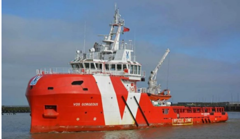
Figure 1: Image of the Vos Gorgeous.

The works will be carried out by two red survey vessels - the Vos Gorgeous (60 m) and the Ocean Marlin (66.8 m). Images of the vessels that are to be used for the works can be seen in Figures 1 and 2.